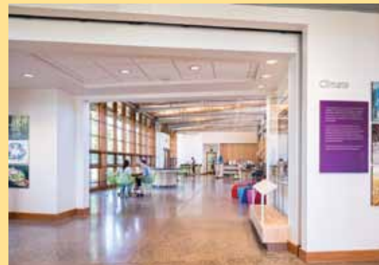
A view into Margaret Rolland Gorrie Hall at the Watershed Center.

We invite families and adults to come experience the children's discovery space, interactive exhibits, and live animal displays. We offer free coffee, tea, and wireless internet in our Center, along with dawn to dusk access to our hiking trails, seasonal butterfly house, and 930 acres of beautiful Watershed Reserve.