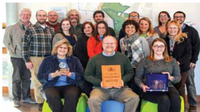
The Watershed Staff hold their 2015 environmental awards.