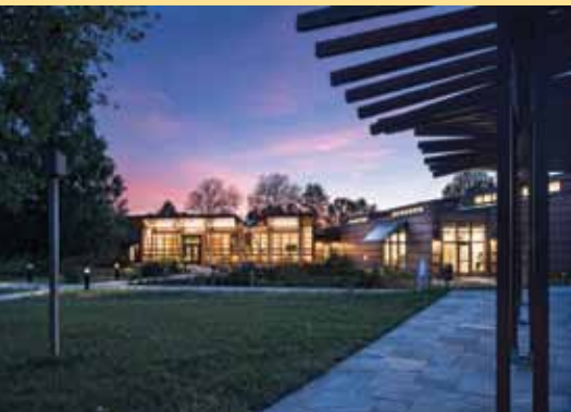
The Watershed Center hosts nighttime programs and events as well.