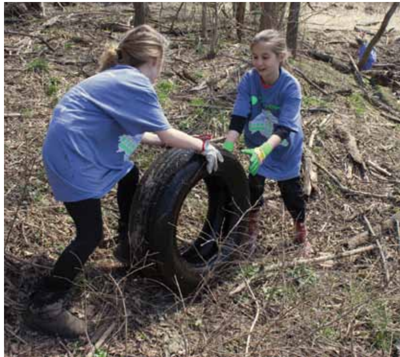
Volunteers remove trash during the 2015 stream cleanup in West Windsor.

Unfortunately, the NJDEP's proposed changes are very light on critical planning processes and would lessen protection