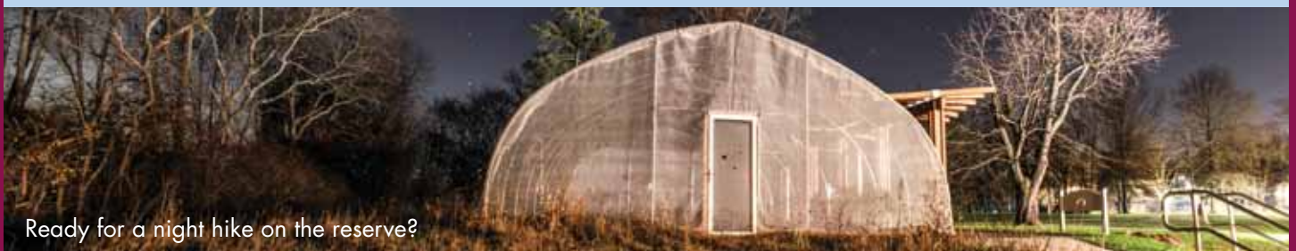
Ready for a night hike on the reserve?

Learn how the Watershed Center and the plants on our Reserve are powered by the same energy source—the sun. We'll explore practical and creative uses of the sun's energy including our solar balloon launch and solar bug race. This event is co-sponsored by Washington Crossing Audubon Society.